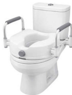
TOILET RAISER WITH SUPPORT HANDLES