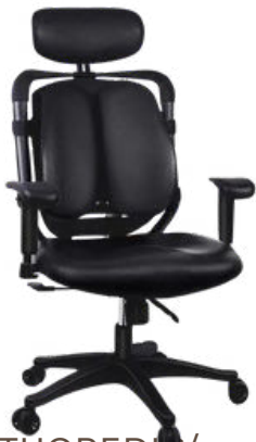
ORTHOPEDIC/ ERGONOMIC CHAIR