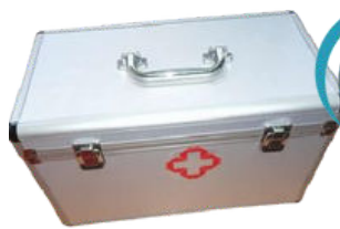
SILVER FIRST AID BOX