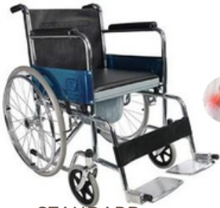
STANDARD COMMUNE WHEELCHAIR