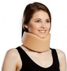
ADULT SOFT CERVICAL COLLAR