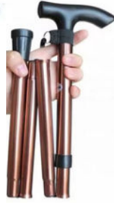
FOLDABLE WALKING STICK