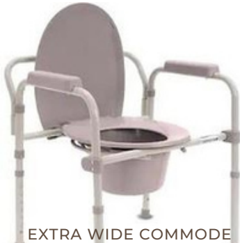
EXTRA WIDE COMMODE FRAME WITH A SPLASH GUARD