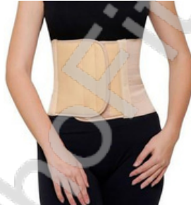
ELASTIC LUMBAR SUPPORT