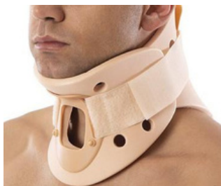
PHILADELPHIA CERVICAL COLLAR