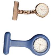
PLASTIC NURSE WATCH