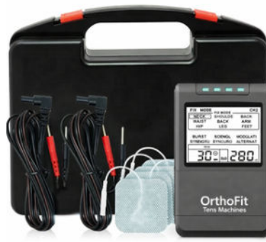
TENS MACHINE CABLES + PADS