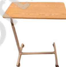
OVER THE BED TABLE