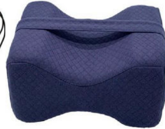
GEL NECK CUSHION