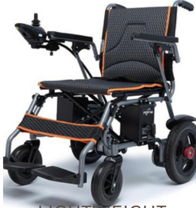
LIGHTWEIGHT ELECTRIC WHEELCHAIR MA112