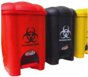
PEDAL BINS - PLASTIC