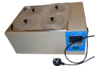
WATER BATH (12L)