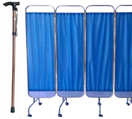
WARD SCREEN 4 FOLD