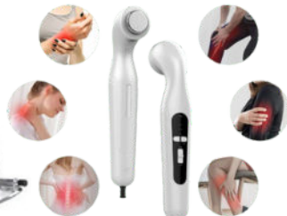
PORTABLE ULTRASOUND THERAPY MACHINE