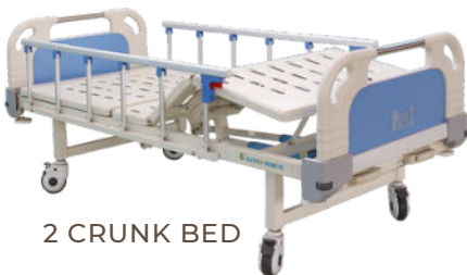
2 CRUNK BED