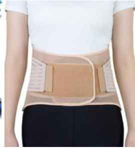
ELASTIC LUMBAR SUPPORT