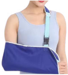
ADULT ARM SLING