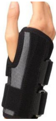
AIRMESH WRIST SPLINT