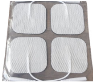
TENS ELECTRODE PADS