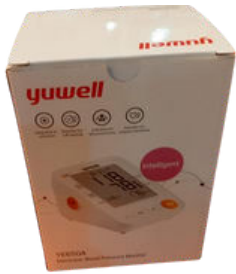
YUWELL BP MACHINE