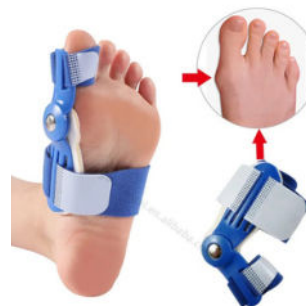
TOE BUNION CORRECTOR