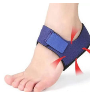
HEEL SPUR FIX