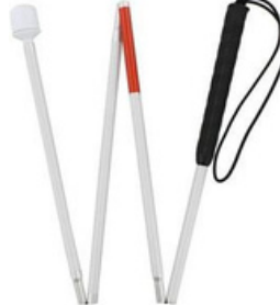
BLIND CANE STICK FOLDABLE