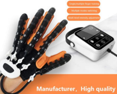
Manufacturer, High quality