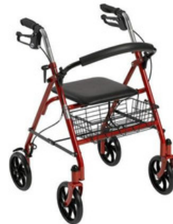
ROLLATOR WALKING AID