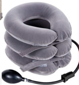
AIR INFLATABLE NECK PILLOW