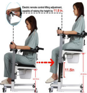
ELECTRIC PATIENT TRANSFER CHAIR