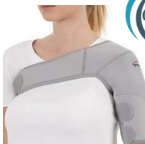
AIRPRENE SHOULDER SUPPORT